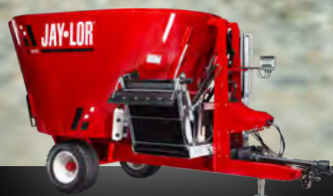
SINGLE AUGER TMR MIXERS