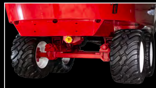
MORE AXLE & TIRE OPTIONS