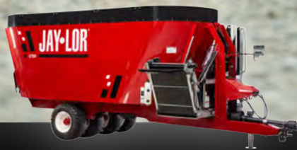
TWIN AUGER TMR MIXERS