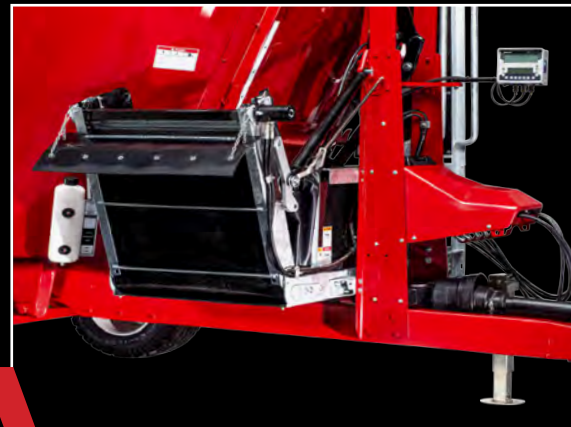
SHORT WING CONVEYOR