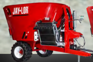
ALL-TERRAIN TMR MIXERS