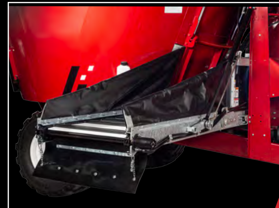
LONG WING CONVEYOR