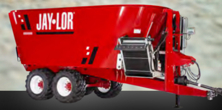
HEAVY DUTY TMR MIXERS