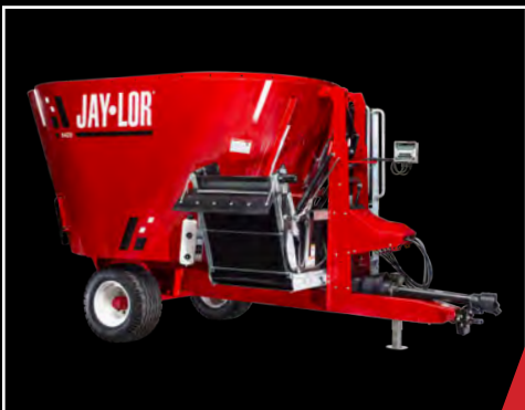
6425 SINGLE AUGER MIXER

Introducing the Jaylor 6000 Series Vertical Mixers. Featuring our patented Square-Cut Auger, trusted worldwide for its efficient bale processing and uniform rations in less time, with less horsepower than traditional round auger mixers.