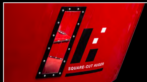
50% LARGER VIEWING WINDOW